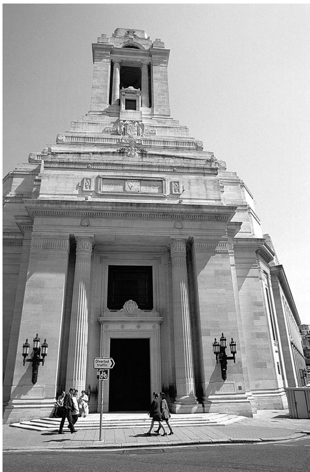
United Grand Lodge, London, Freemason's HQ.

The Select Committee report concludes: "Progress has been slow, particularly with the police.....We call on the government to speed up the process of establishing the registers of masonic status among the police and other parts of the criminal justice system, and to announce a firm timetable for completion of the exercise..... Additionally the names of all those who have failed to indicate whether or not they are masons should be published; such persons should not be allowed to exempt themselves entirely from the process simply by declining to co-operate."